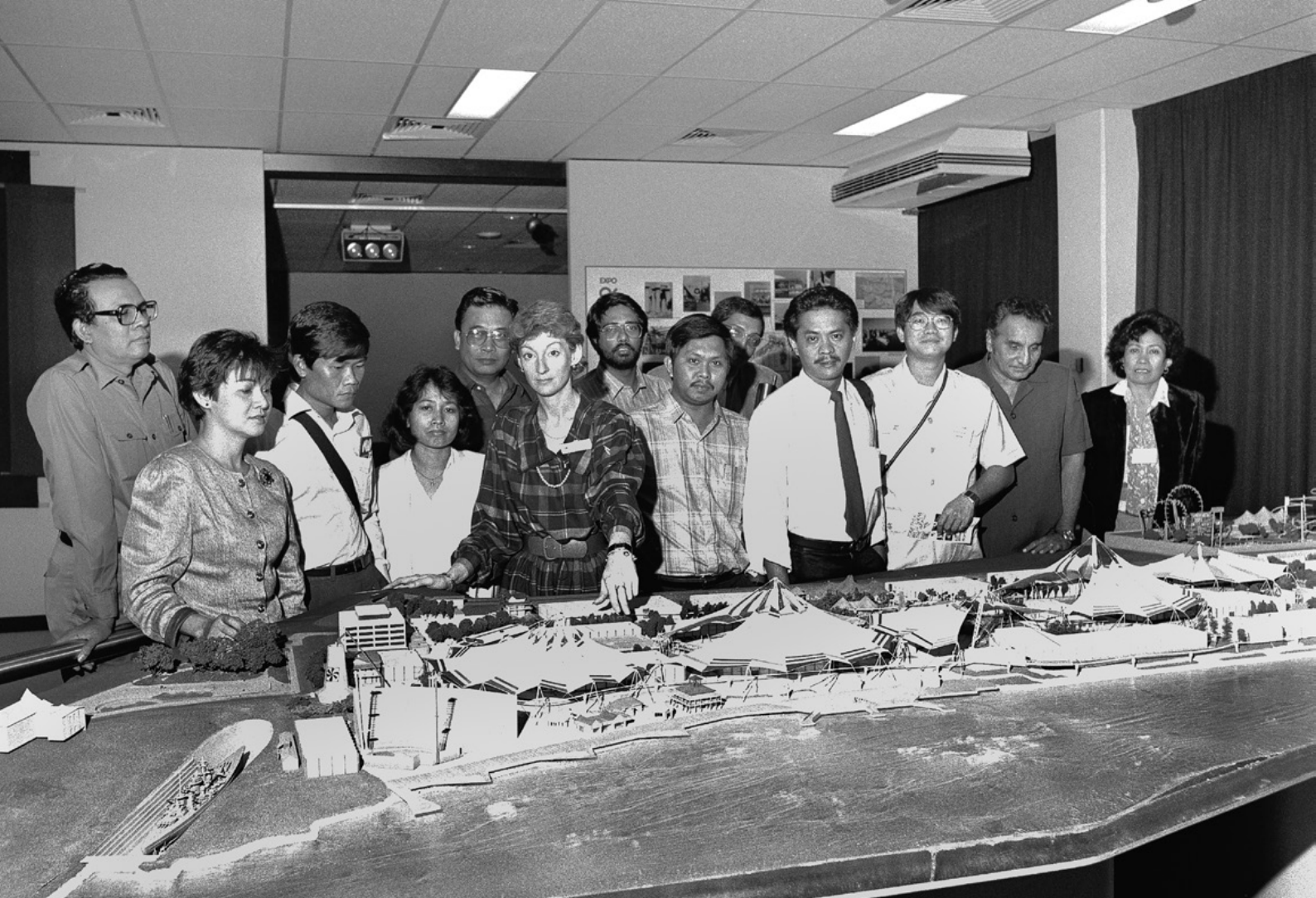
▲ ASEAN journalists visit the World Expo '88 site, 1987. NAA: A6180, 1/5/87/3.