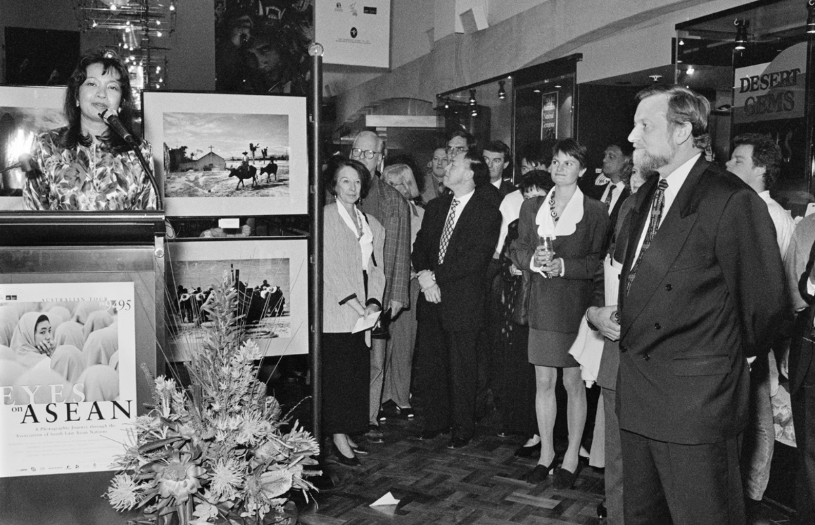
▲ Australian Foreign Minister, Gareth Evans, opens Eyes on ASEAN exhibition in Melbourne, 1994. © Image courtesy of the National Archives of Australia. NAA: A6180, 18/10/94/10.

The COVID-19 global pandemic brought a temporary pause to much of the easy flow of people-to-people engagement between Australia and ASEAN. For long periods from 2020-2022, national and local borders impeded the movement of travellers and business people and required new approaches and systems to ensure health and economic security. Many Australians and Southeast Asians could not enjoy their usual range of easy linkages to each other. It was also a period of significant technological innovation, with some ASEAN countries leading the world in their pandemic responses, managing complex social and humanitarian issues, while maintaining commercial linkages.