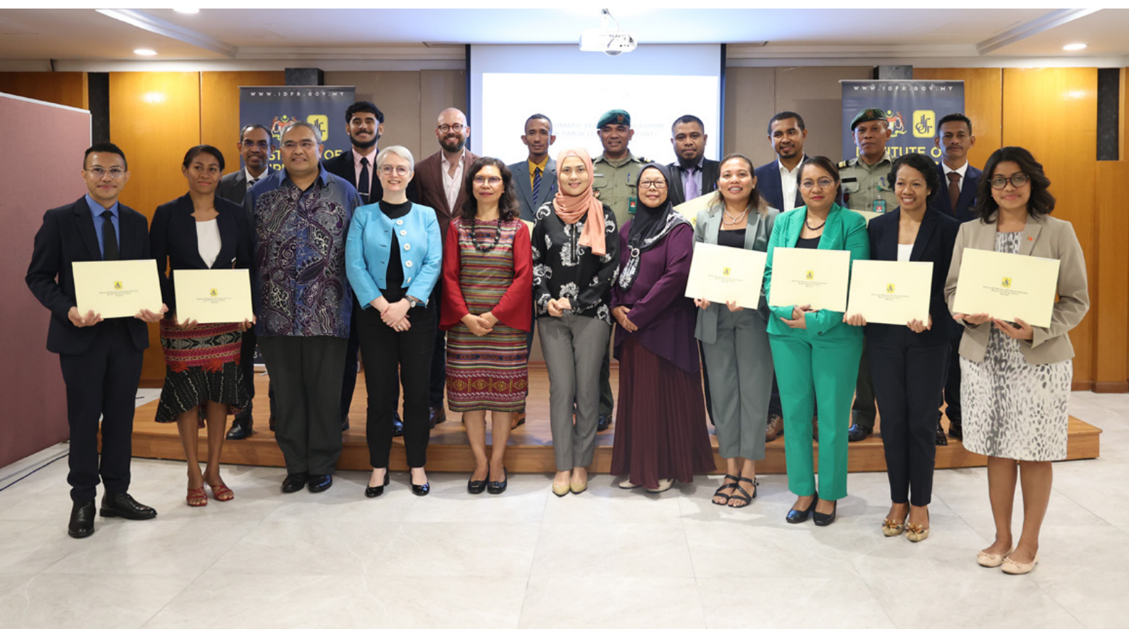
▼ Timor-Leste officials in a Diplomatic Training Programme supported through trilateral cooperation between Malaysia, Australia and Timor Leste, Kuala Lumpur, September 2023.

The current assessment in ASEAN capitals is that Australia is a trusted and energetic partner. The fiftieth anniversary of Dialogue Partnership highlights many aspects of this partnership. ASEAN engagement by the Australian Department of Foreign Affairs and Trade is certainly broad and active. At the same time there are questions raised about the whole-of-government commitment from Australia and the need to ensure that a broad-base of relevant Australian institutions are involved. There is scope to broaden the level of engagement by other ministries across diverse ASEAN sectoral bodies through formal Senior Official and ministerial engagement, given Australia can sometimes be seen as lagging in this area in contrast to other ASEAN Dialogue Partners such as China, Japan and the Republic of Korea.