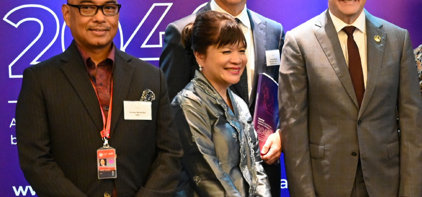
▲ The Hon Anthony Albanese, Prime Minister of Australia, Senator the Hon Penny Wong, Minister for Foreign Affairs, Australia, Mr. Nicholas Moore, Australia's Special Envoy for Southeast Asia, and Indonesian dignitaries, including Mr. Asjad Rasjid, Chairman of the Indonesian Chamber of Commerce and Industry, at the launch of Invested: Southeast Asia Economic Strategy to 2040 in Jakarta, 6 September 2023.