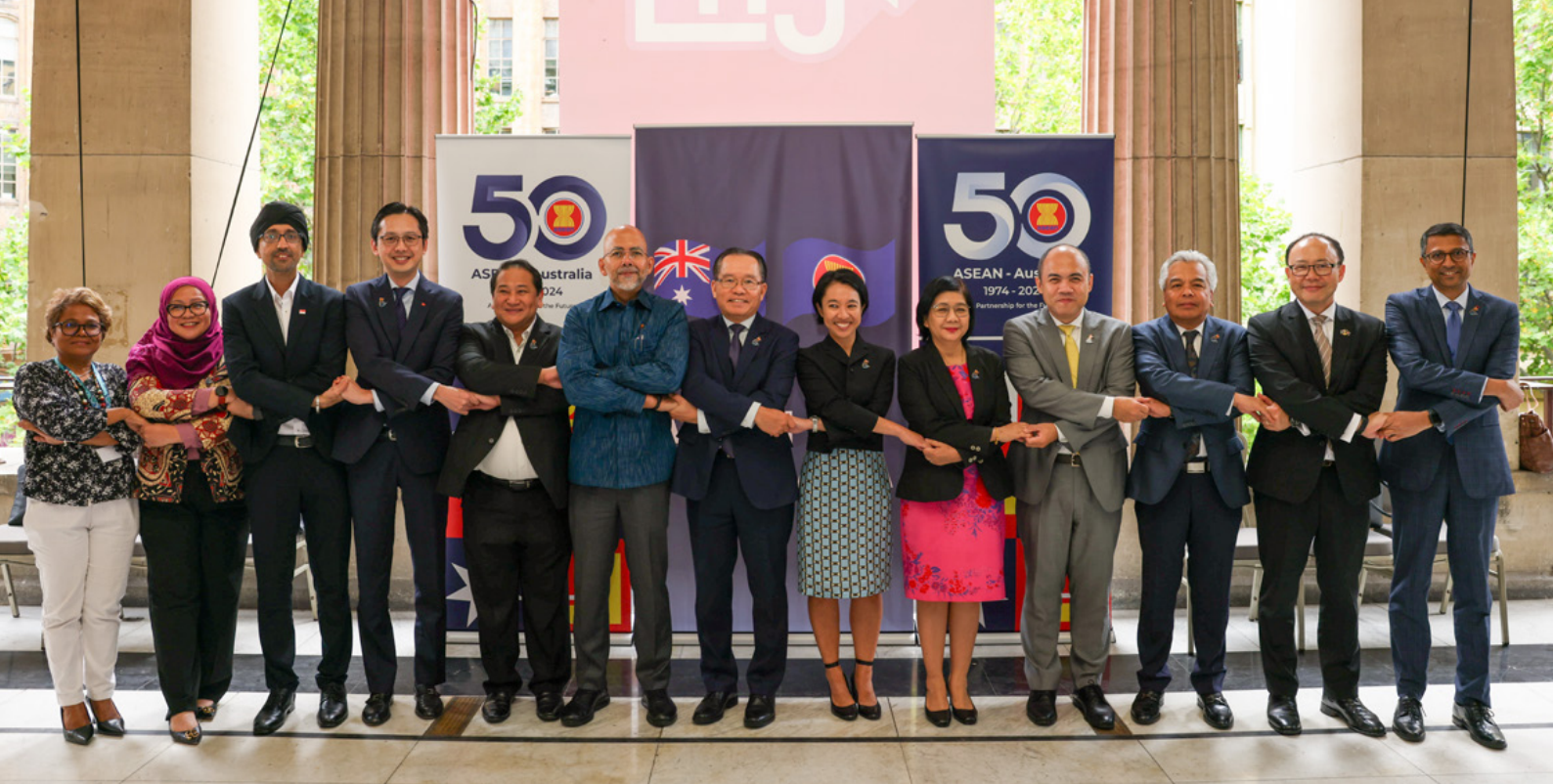
▲ Australia hosts ASEAN officials for the 36th ASEAN Australia Forum in Melbourne, ahead of the ASEAN-Australia Special Summit in 2024, 5-6 February 2024.

The reality, according to one ASEAN emerging leader, is that “we have a very positive sense of Australia, but the Australia-ASEAN relationship isn’t something that immediately comes to mind”. The reason for this, he suggests, is that so much geopolitical discussion is framed around the United States and China, and so there is simply less space to consider some of the other important relationships that help to support Southeast Asia’s success, such as the enduring ASEAN-Australia partnership. In this context, he says that the fact Australia is “showing up is very important for creating networks”.